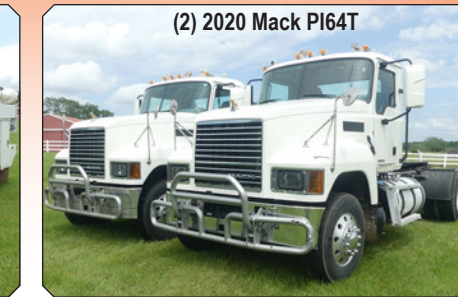
(2) 2020 Mack P164T