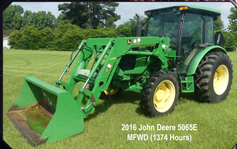
2016 John Deere 5065E MFWD (1374 Hours)

LIVE ONSITE AND ONLINE BIDDING - DRIVE-THRU AUCTION HELD RAIN OR SHINE