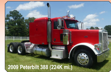
2009 Peterbilt 388 (224K mi.)