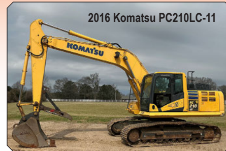
2016 Komatsu PC210LC-11