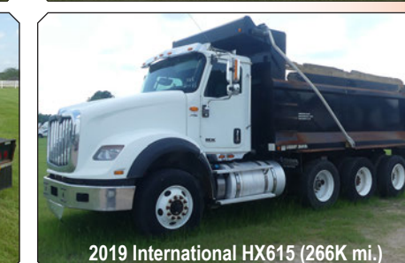
2019 International HX615 (266K mi.)