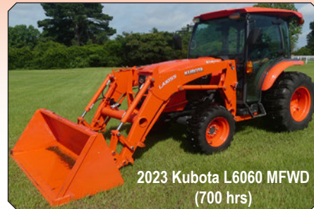
2023 Kubota L6060 MFWD (700 hrs)