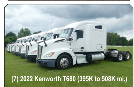
(7) 2022 Kenworth T680 (395K to 508K mi.)