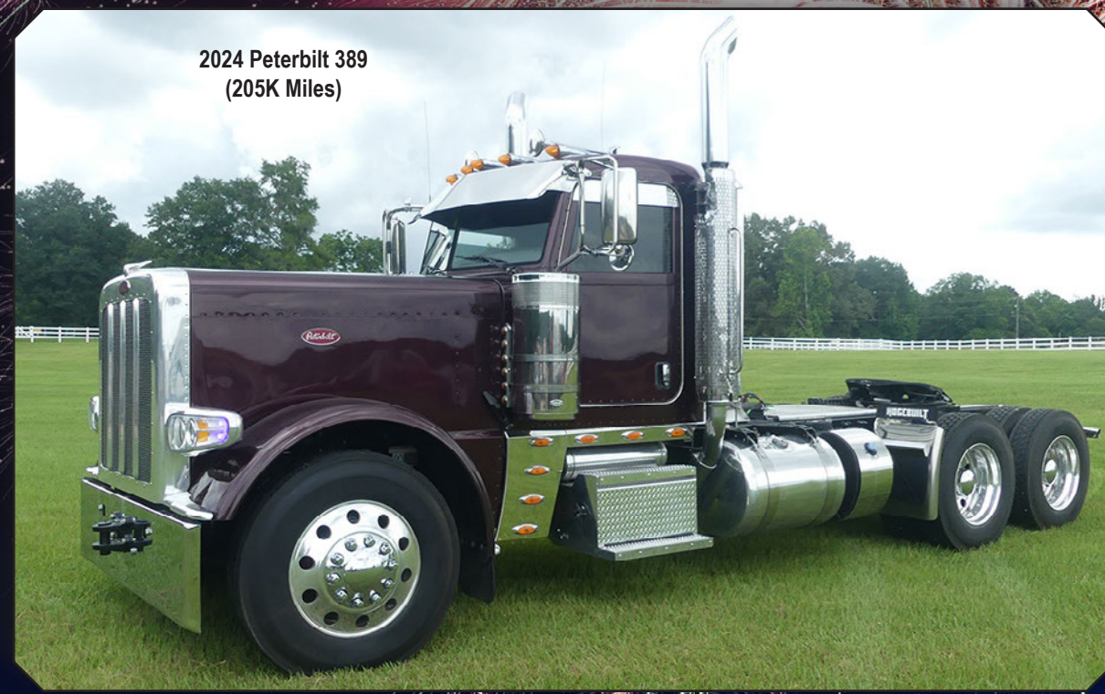
2024 Peterbilt 389 (205K Miles)

PLEASE NOTE: Buyers premium is 10% on the first $5000 then 3% on the remaining balance of each item.