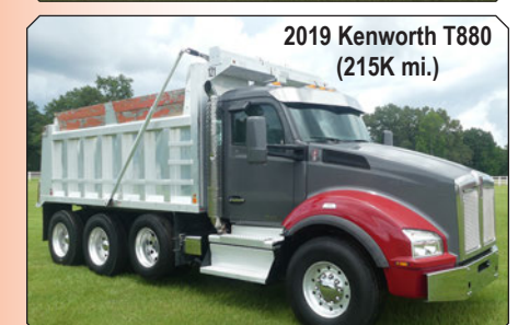
2019 Kenworth T880 (215K mi.)