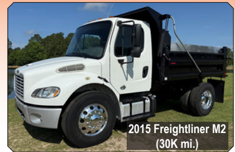
2015 Freightliner M2 (30K mi.)