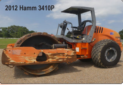
2012 Hamm 3410P