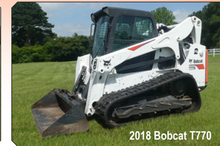
2018 Bobcat T770