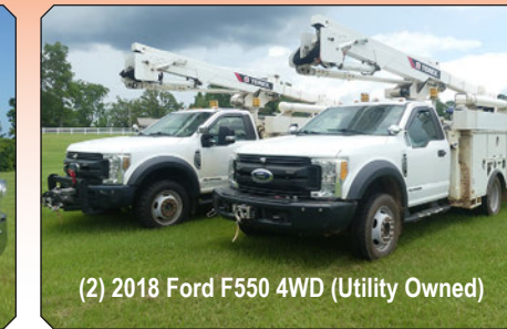
(2) 2018 Ford F550 4WD (Utility Owned)