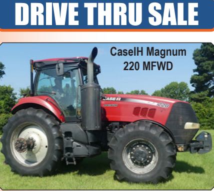
CaseIH Magnum 220 MFWD