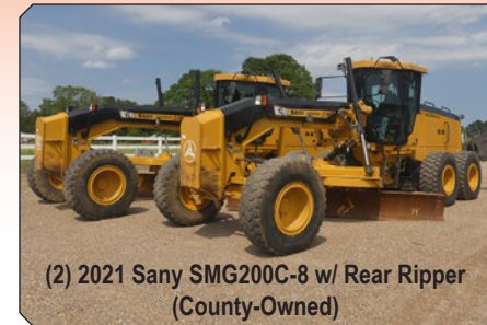
(2) 2021 Sany SMG200C-8 w/ Rear Ripper (County-Owned)