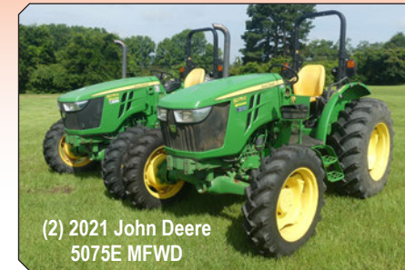
(2) 2021 John Deere 5075E MFWD