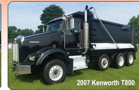
2007 Kenworth T800