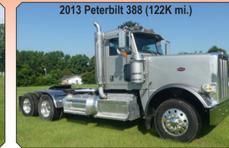
2013 Peterbilt 388 (122K mi.)