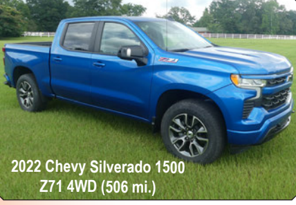
2022 Chevy Silverado 1500 Z71 4WD (506 mi.)