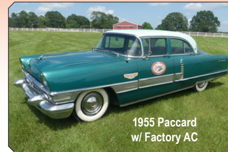
1955 Packard w/ Factory AC