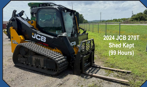
2024 JCB 270T Shed Kept (99 Hours)

HUGE 1-Day Contractors' Equipment & Truck Public Auction