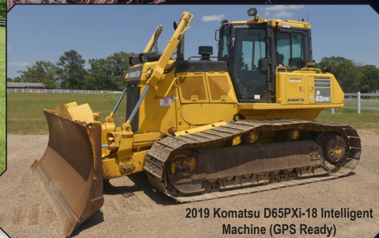
2019 Komatsu D65PXI-18 Intelligent Machine (GPS Ready)

PLEASE NOTE: Buyers premium is 10% on the first $5000 then 3% on the remaining balance of each item.