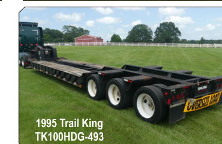
1995 Trail King TK100HDG-493