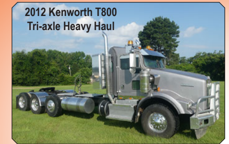
2012 Kenworth T800 Tri-axle Heavy Haul