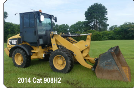
2014 Cat 908H2