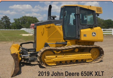
2019 John Deere 650K XLT